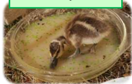
Whistling Duck

If you have any useful items related to rescuing or caring for wildlife to either give away or sell contact Lola Mudie on 07 4946 1281 or melo@mackay.net.au